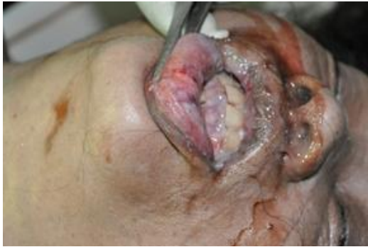
Mucosal surface of lips showing contusions