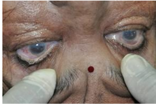
Eyes with petechial haemorrhages