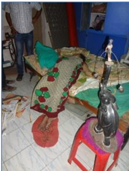
Position of the body found at crime scene