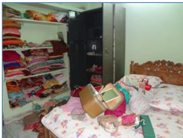
One of the rooms at crime scene